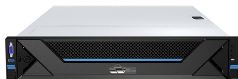
RG-RCD3000 V3 Cloud Class Server