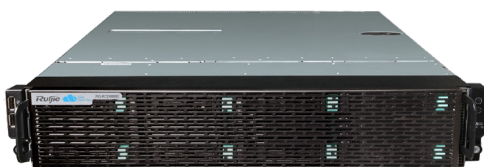
RG-RCD6000E V3 Cloud Class Server

The innovative application value and technical advantages of Cloud Class Servers, including RG-RCD6000E V3 and RG-RCD3000 V3 in the computer room environment will bring a new round of reshuffle to the informatization construction of the computer rooms in school campus. Currently the cloud desktop technology is emerging rapidly, especially in the education sector. It is a common belief among the clients in the education sector that the technological innovation can enhance teaching efficiency and will become an inevitable trend of future development.